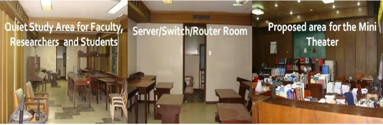
Figure 2. The Proposed Area for the University Library Information Common (ULiCOM)